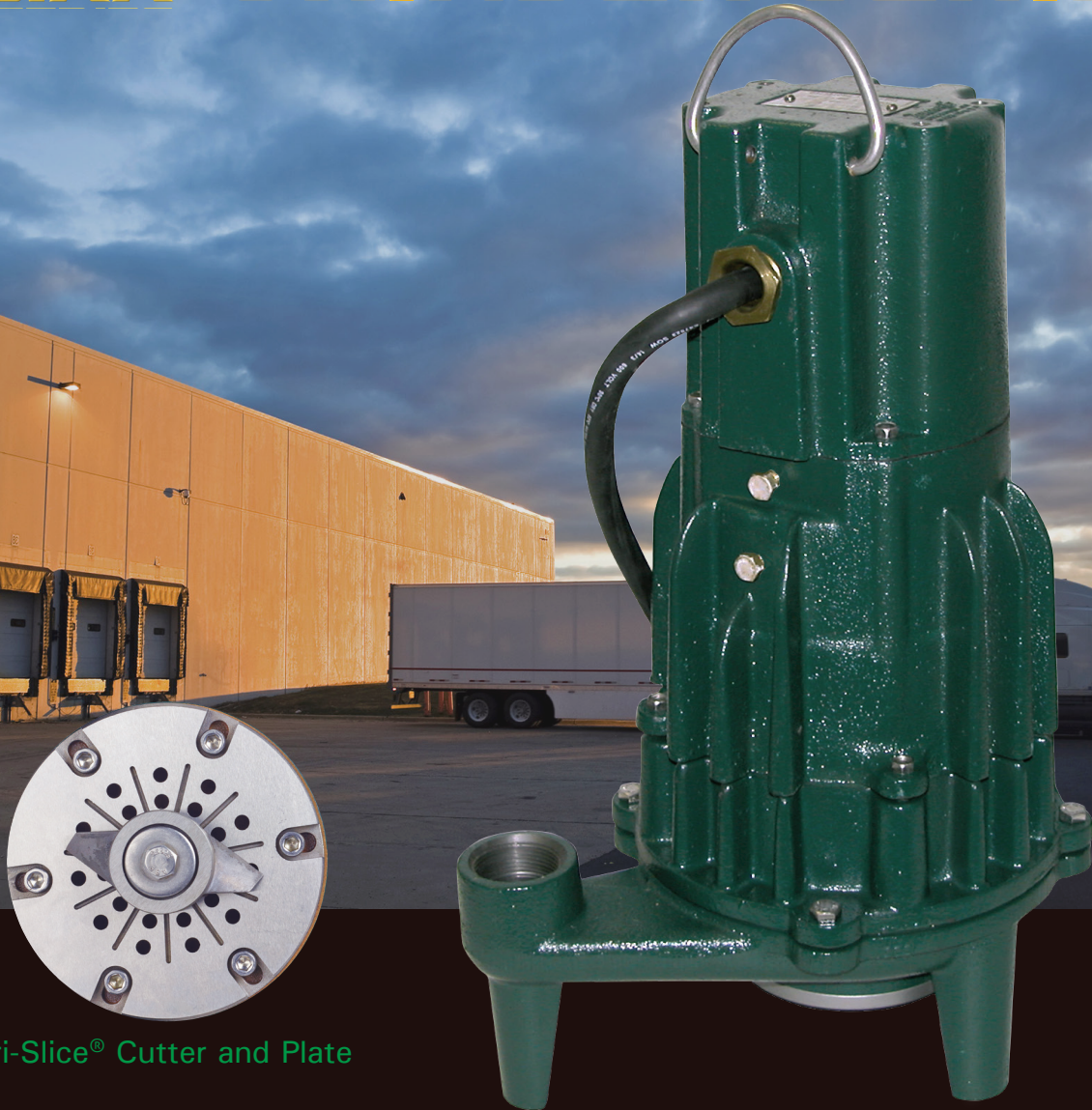
Tri-Slice® Cutter and Plate